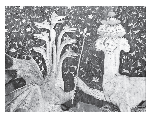
Late-14th-century French tapestry: Satan giving power to the Beast

The ideals engulfing the United States (and much of the world) are ideals of evil—subjugation, coercion, violence, hatred, and defilement. As Uranus crosses the Aries-Taurus cusp this year, those who name this evil will be forced to separate from those who refuse to do so.